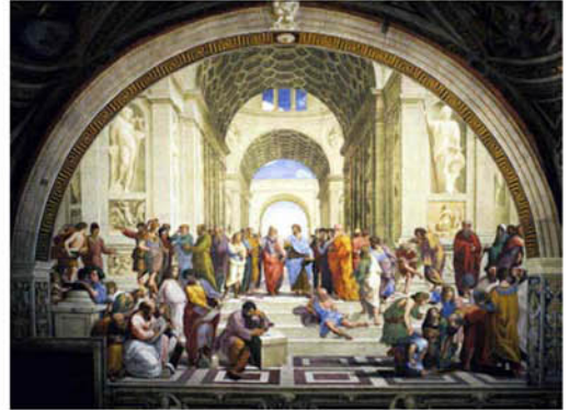
Raphael The School of Athens