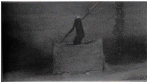
Alfred Kubin Death