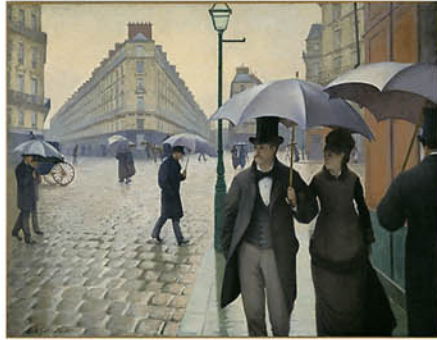
Gustave Caillebotte Paris Street, Rainy Weather

1. Which one of these works of art are examples of: A) Symmetrical Balance, B) Approximate Symmetry, C) Radial Symmetry, D) Asymmetrical Balance? (Hint more than one term on the list may describe the work of art, please put all that apply)