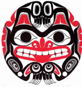
Bill Reid Haida Grizzly Bear