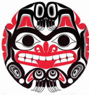
Bill Reid Haida Grizzly Bear