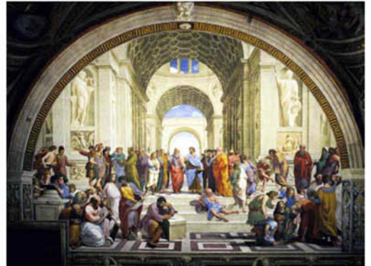
Raphael The School of Athens