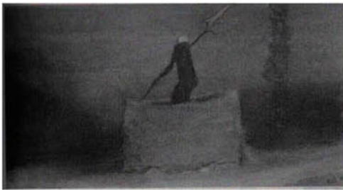
Alfred Kubin Death